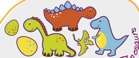
The lost world of Dinosaurs

Explore the Students will explore how to protect and make sure animals are around for many generations. Children will discover a love for animals and how we as humans can make sure they are safe and healthy.